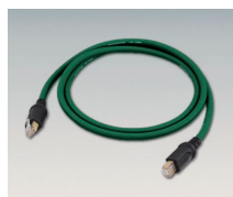
HS-LINK Cable AHDL-15