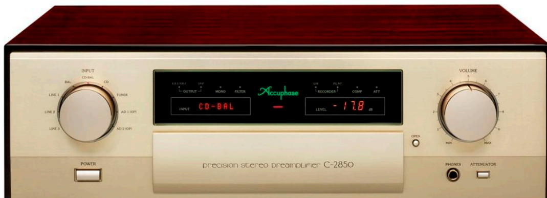
Precision Stereo Pre-amplifier C-2850 launched in 2016