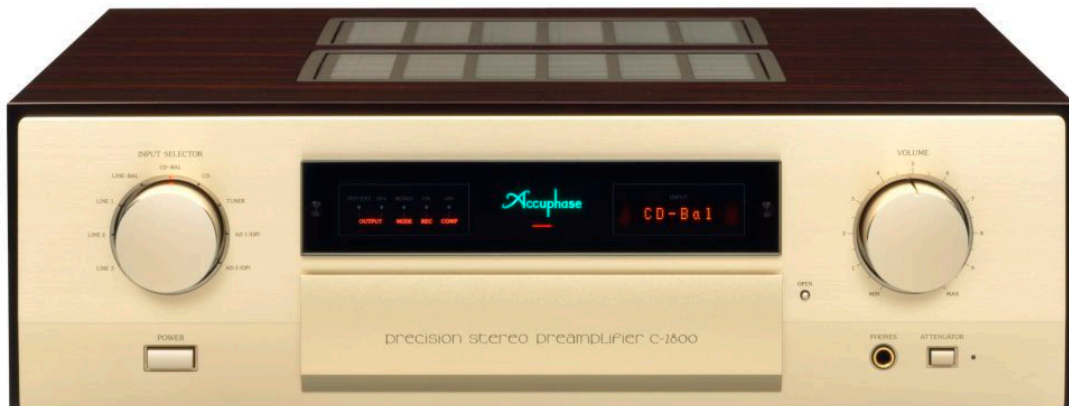
Precision Stereo Pre-amplifier C-2800 launched in 2002